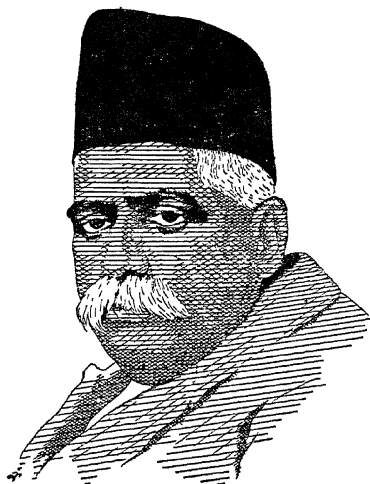
Dr. K. B. Hedgewar THE FOUNDER